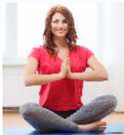
Yoga / Meditation